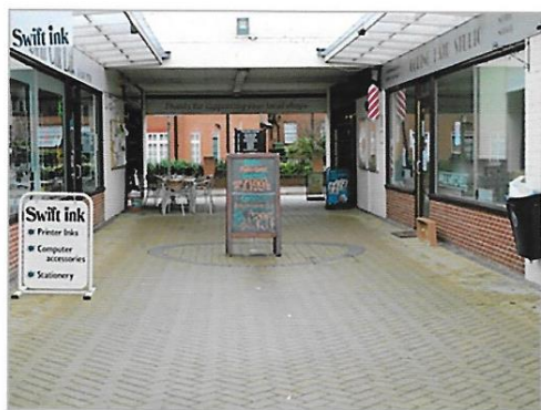
Shopping Arcade Before and After