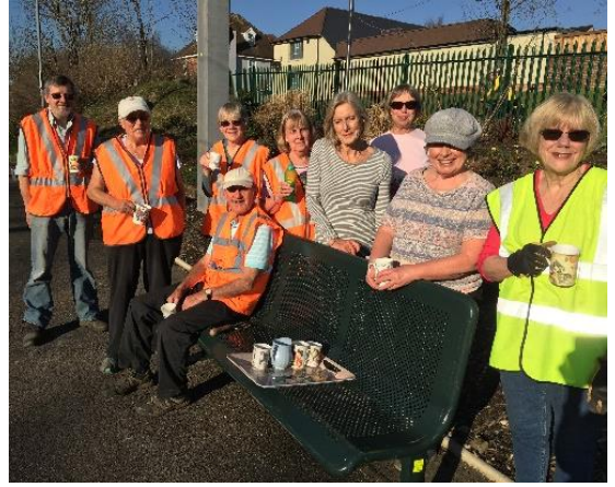
Daffodils & maintenance