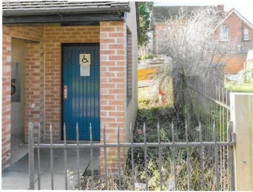
Public Toilet area Before and After