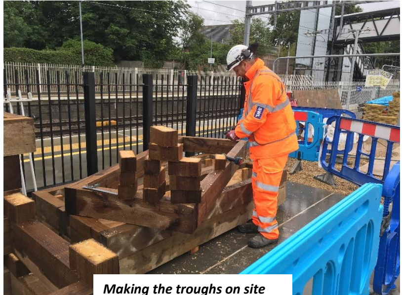
Making the troughs on site