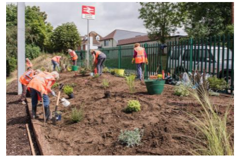
Making the bed July 2017