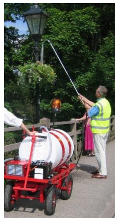
Volunteer watering crew with the bowser

In 2023 the reluctant decision was taken to hand over provision of the hanging baskets to Goring on Thames Parish Council, which uses the services of a commercial company street decorations.