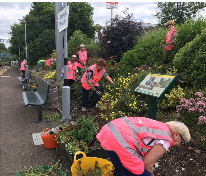
Wearing our new new official GWR pink vests 2022