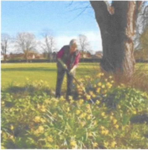
Year round colour from all aspects