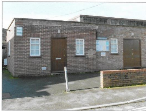
Goring Parish Council Offices Before and After