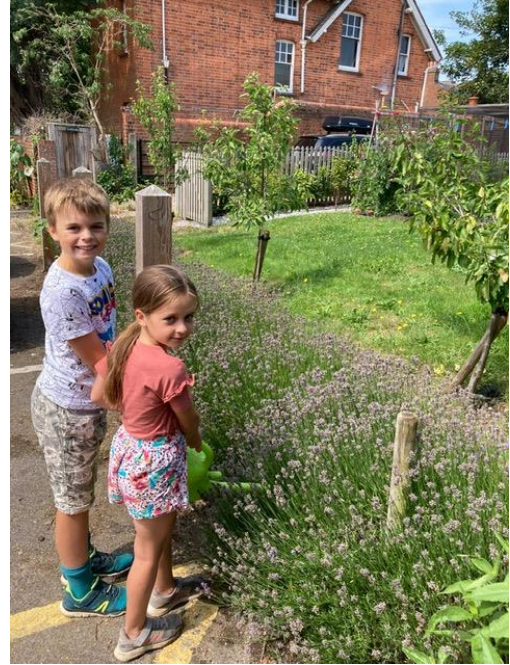
Before (above) and in summer 2021 (right)