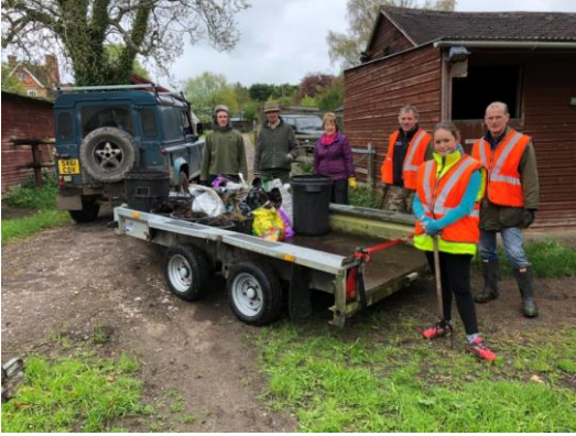
Getting manure for the bank