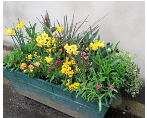
Winter and Spring