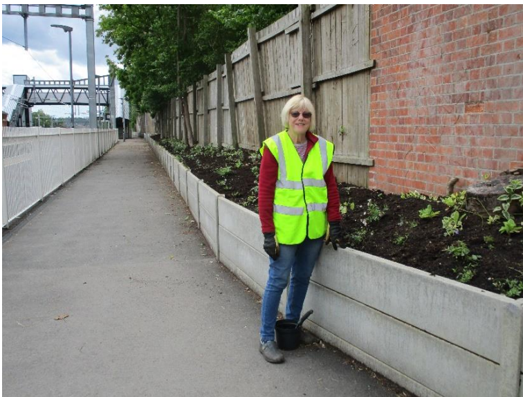
Dwarf daffodils were planted for spring colour Note the ugly concrete posts

This turned out to be 50 x 40 litre bags! Planting was problematic – what would grow in a thin layer of soil in an exposed position, shaded for part of the day and in some places under mature trees? And then how would the plants be watered until established? Little deters Goring-on-Thames in Bloom. Suitable ground cover plants were grown and a nearby householder allowed us to use his outside tap. Most of the plants have taken and the bank looks good all year round.