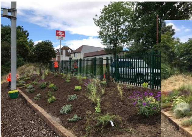
One year later