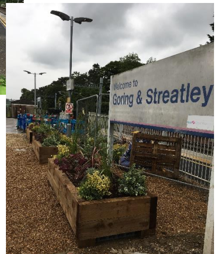
Getting there! Four more troughs to go