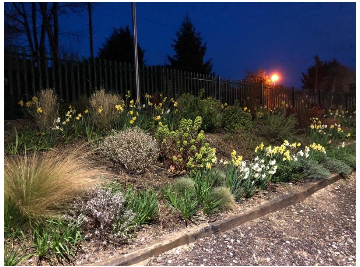
Attractive by night and day